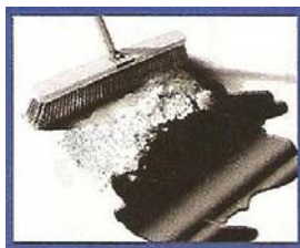
Using a stiff bristle broom or brush, work in a circular motion.