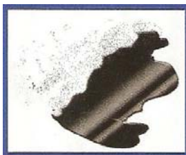
Surround and cover with MAGICSORBLAP